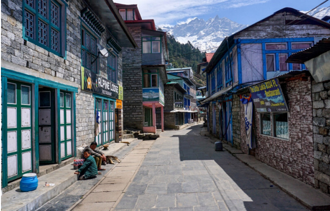
Lodges are now waiting for tourist