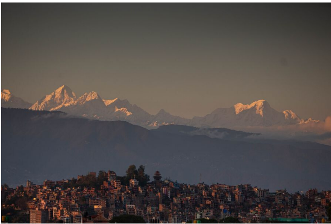
Mountain views from Kathmandu