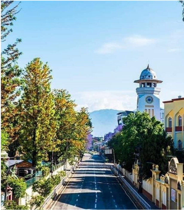
Empty city road outside Ghantaghar

The lock down started in March 23rd, 2020 and at the time there were only 2 cases. Out of these 2 cases, 1 had fully recovered and the other one was in isolation. Today after 59 days of the lock down, Kathmandu has seen the numbers of infected going in upward with 10 infections in Kathmandu and 3 in Chitwan along with other 453 out of which 42 has fully recovered and 3 deaths.