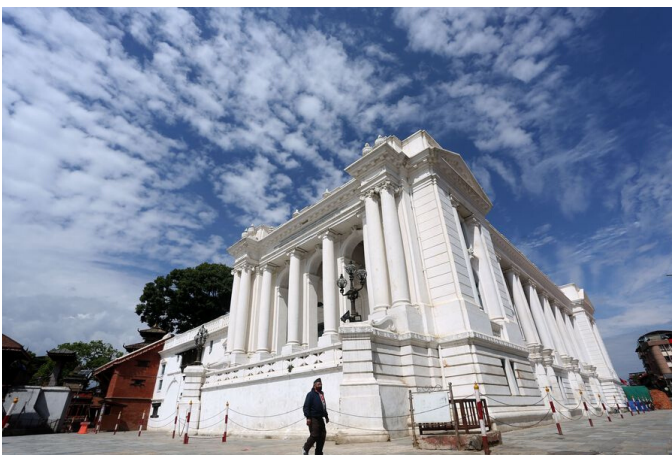
Heritage sites waiting for tourists