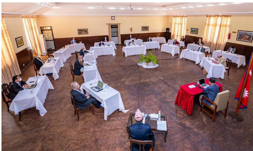
Cabitnet meeting to extend lock down

17th: Nepal announces temporary suspension on visa-on-arrival for Italy, Spain, China, S. Korea, Iran and Japan