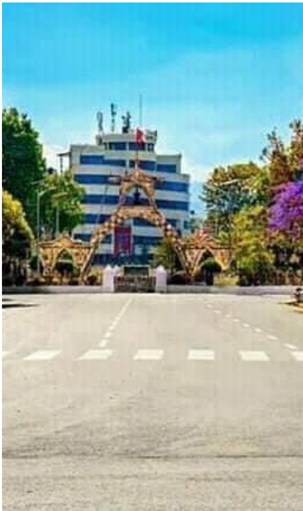
Empty city road at Sahid Gate

The lock down started in March 23rd, 2020 and at the time there were only 2 cases. Out of these 2 cases, 1 had fully recovered and the other one was in isolation. Today after 59 days of the lock down, Kathmandu has seen the numbers of infected going in upward with 10 infections in Kathmandu and 3 in Chitwan along with other 453 out of which 42 has fully recovered and 3 deaths.