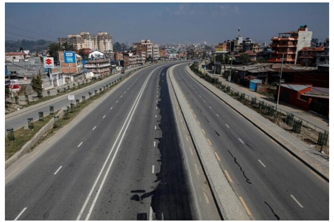
Empty City roads of Kathmandu

We, at Thamserku hope you are doing well and doing your part to break the chain.