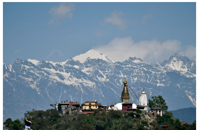
Clear weather with Swayambhu