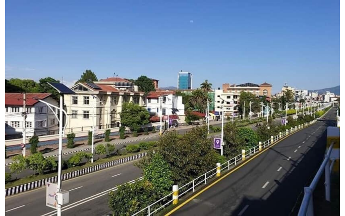
Empty City roads of Kathmandu